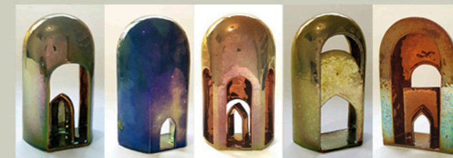
Five variations by Azadeh Shooli, Iran

The collection of the works created for the project is presented to the public in a travelling exhibition designed to be shown in museums, art schools and other cultural centres before it eventually joins the permanent collection of an Iranian museum.