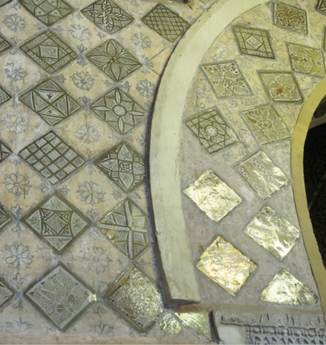
Detail of the Mihrab of the great mosque of Kairouan, Tunisia