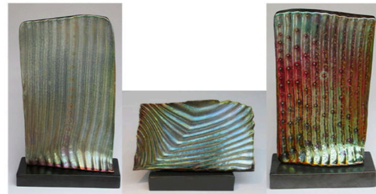
Three steles by Alain Valtat, France

The catalogue section of the book is preceded by a series of studies dealing in particular with the fascination of lustreware's iridescent highlights, its technical complexities and its history from 8 th century Mesopotamia up to the present day, with many contemporary ceramists worldwide taking lustreware to new levels of expression.